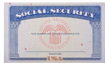
Social Security Card*