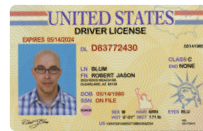
State ID or Driver's License or REAL ID (keep on you when out)